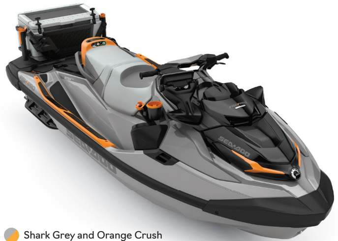
Shark Grey and Orange Crush